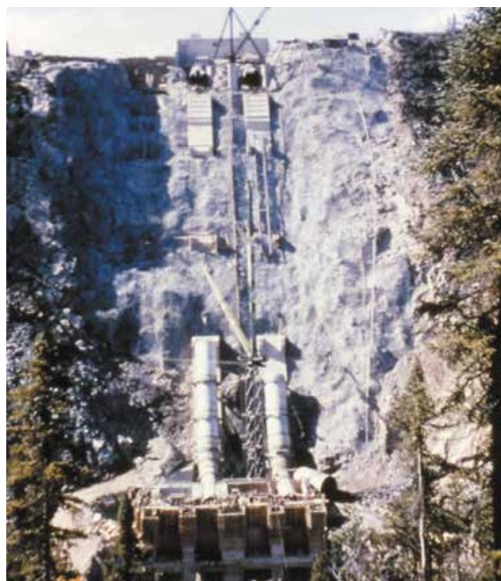
1960 Twin Falls power project under construction