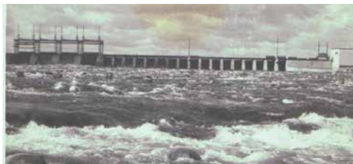
1958 Menihok Hydro Station, Labrador