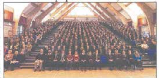
GOOD SHOW: The whole of Duke of York's Royal Military School poses in the Nye Hall.

have accurately identified the critical areas for improvement in the school and are rapidly securing improvements.