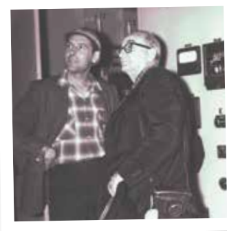
1962 Art with Premier Smallwood of Nfld at Twin Falls opening