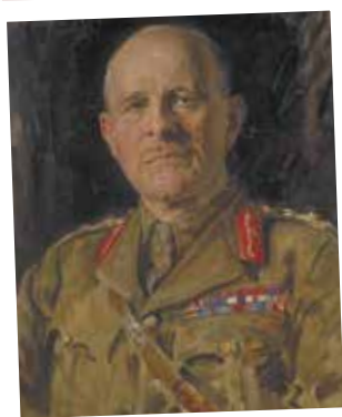
Field Marshal Lord Gort VC